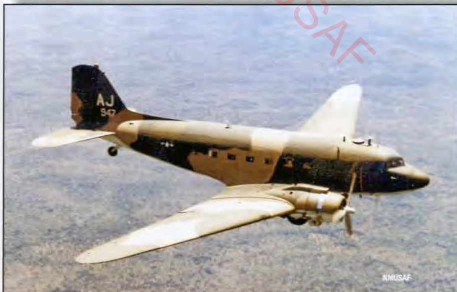
A Douglas EC-47 over Vietnam.

We trained in C-47s at England AFB in Alexandria, Louisiana. The training was mostly for the pilots. Because of the highly classified nature of the mission, the aircraft did not have the secret equipment we were to use in Vietnam to locate and identify enemy electronic emitters. The principal navigation device in the Vietnam configuration was a Doppler radar and computer which, when tied to the extremely accurate gyro-stabilized compass and a high-speed printer, would accurately identify your position and provide bearings to the electronic signal you were monitoring. This Doppler system had to be updated to a reference point on the ground below every eight to ten minutes. This reference point was called a "dop-set" point. The navigator selected an accurately surveyed point on his map, such as a crossroad or the point where a bridge crosses a river bank. The navigator would direct the pilot to fly over the point using a drift meter as a bombsight and update the position in the Doppler computer. None of this equipment was available for us to train on at England AFB.